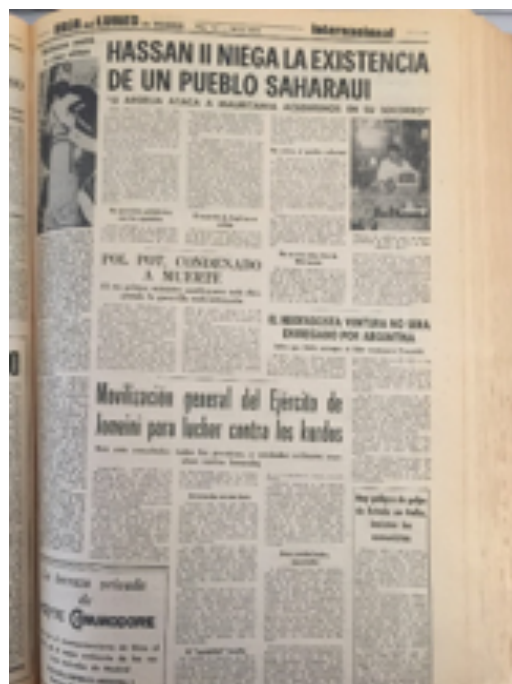
→ Hoja del Lunes, August 1979.

After the Spanish withdrawal, the Polisario Front (the Popular Front for the Liberation of Saguia el-Hamra and Río de Oro), founded in 1973 with the goal of achieving independence, proclaimed the Sahrawi Arab Democratic Republic (RASD, in its Spanish initials), at midnight on the night of 27 February 1976. That signaled the beginning of a long period of armed clashes between the Polisario and the Mauritanian and Moroccan armies. The Mauritanian forces withdrew in 1979, but the Polisario and the Moroccans continued fighting until a ceasefire went into effect in 1991.