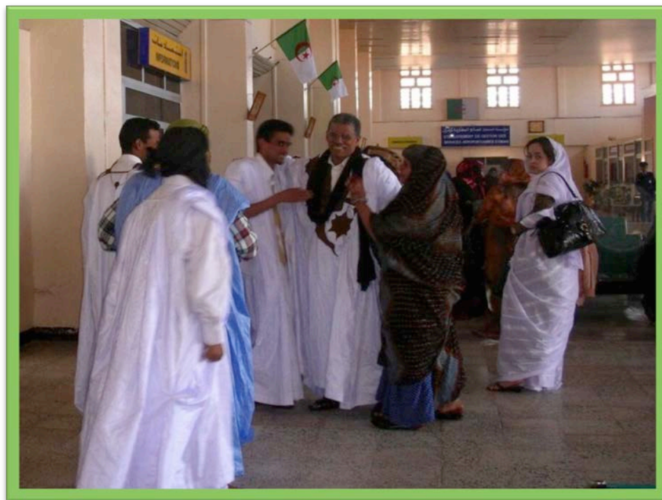
Figure 2 Sahrawi refugees at airport on a CBM visit

These visits enabled IDP community leaders to return safely to their home communities for short periods to verify the security situation and gather information for the IDPs as they planned for the future and made their own decisions about return. These kinds of visit-based confidence-building measures require the negotiated acceptance of all political parties to the conflict, including government and non-state actors. This kind of political negotiation is done by UNHCR.