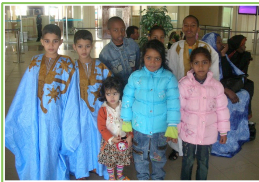
Figure 4 Sahrawi children at airport on a CBM visit

UNHCR wanted five CBM activities: exchange of family visitors, telephone communications, cultural seminars on Western Sahara, a mail service, and an information campaign. The Parties (Morocco and Polisario) agreed to the CBM Plan of Action and it was endorsed by UN Security Council Resolution 1282 in 1999. However, implementation of the Plan was (and is) no easy operational task, because of political disagreement amongst the parties over practical modalities. It therefore took UNHCR three years, from 2000-2003, to begin activities. Two of the planned activities did not happen: exchange of personal mail never occurred because the Parties could not agree on the use of stamps and the distribution of mail to the addressees on both sides of the berm; and the information campaign did not take place as it had been planned in the context of the referendum which never occurred. However, the three activities that took place between 2004 and 2014 dramatically succeeded in their goal of uniting (for a short time) families and enabling communication.