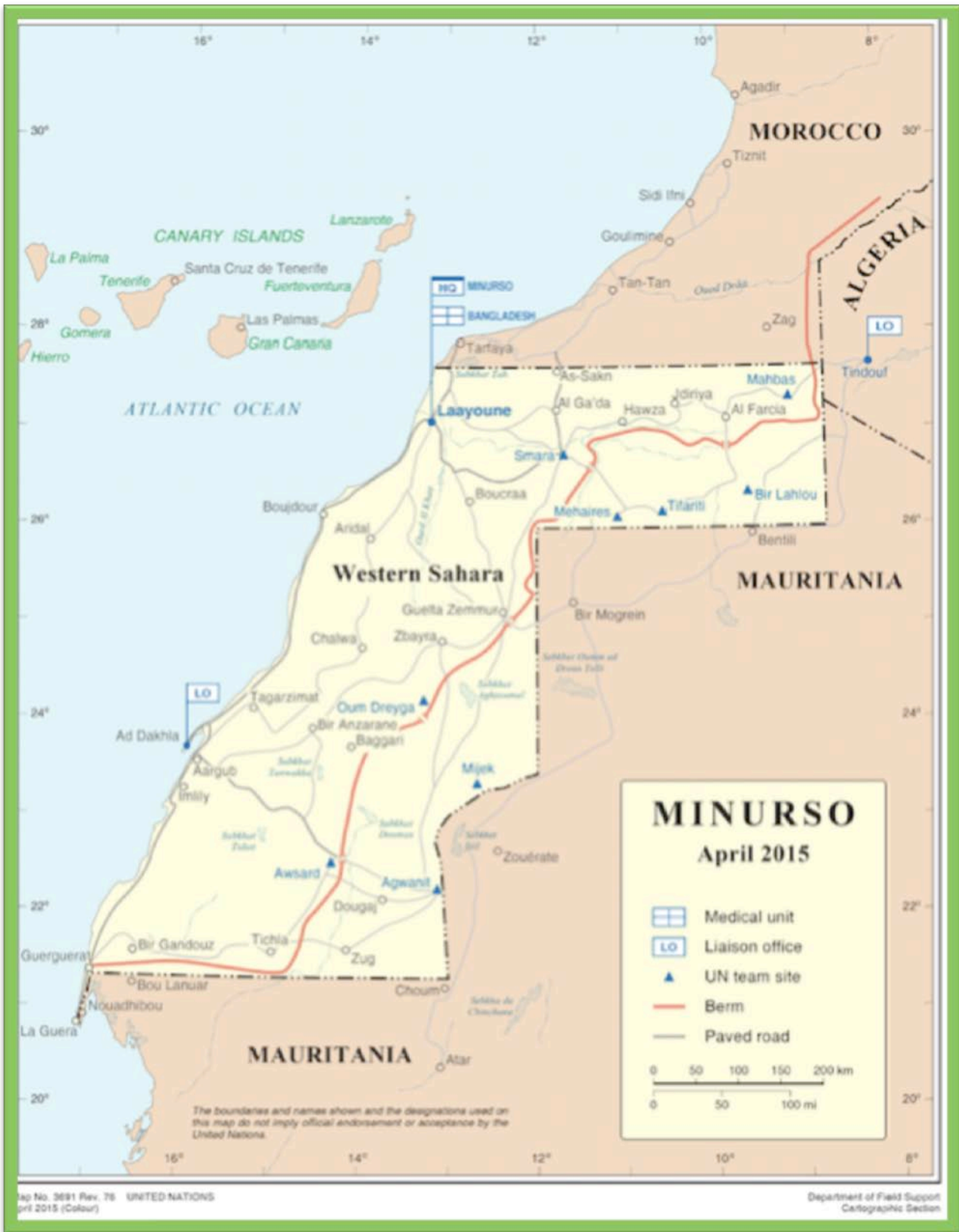
Figure 1. A map of MINURSO.