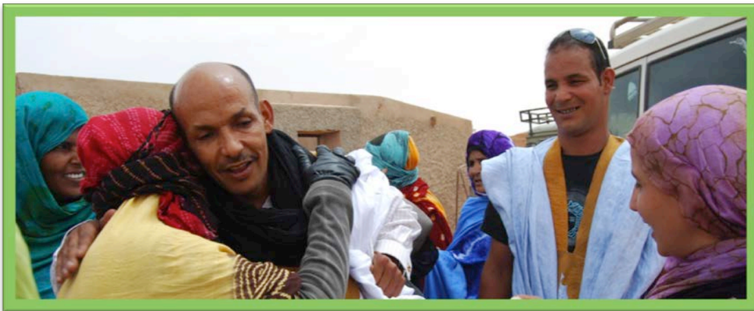
Figure 7 Family meeting in Western Sahara

There are other reasons to hold a coordination meeting soon. Refugees are losing confidence in the program, and UNHCR doesn't want to strengthen the culture of dashed expectations. There is also the need to reassure donors that the Western Sahara political process is active. A coordination meeting provides the opportunity to re-activate (or go beyond) the Plan of Action, and even to encourage re-engagement on wider political discussions. At a minimum, the meeting will reaffirm the importance of CBM for the refugees.