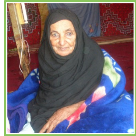
Figure 5 Sahrawi woman

As others have noted: "It is hard to overstate what these five-day visits mean to those lucky enough to benefit." 11 Especially for the older family members, many had not seen their families for more than thirty years, and the children had never met their grandparents or seen their extended families. The visits were extremely popular as evidenced by the huge demand for them.